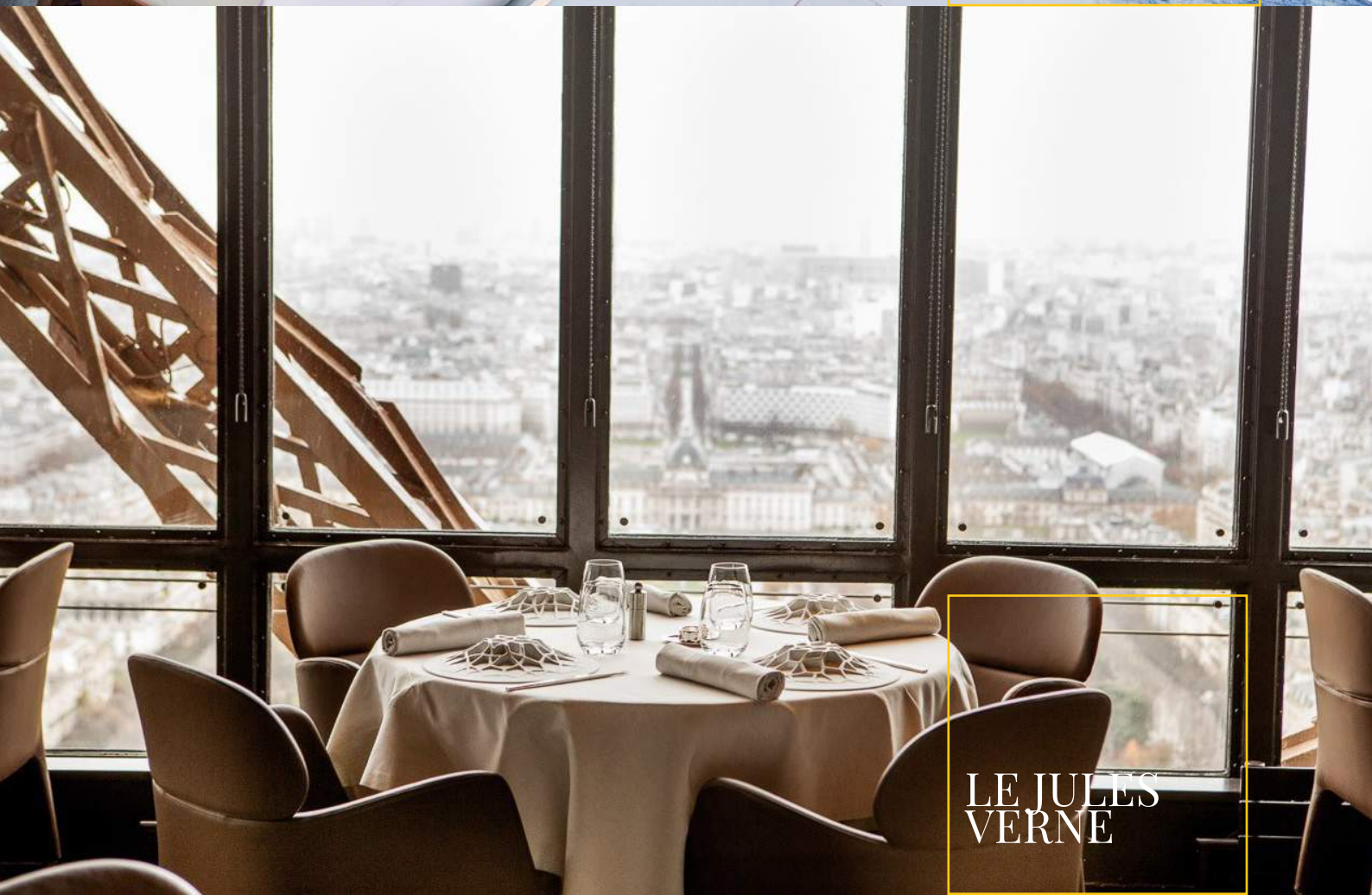
LE JULES VERNE