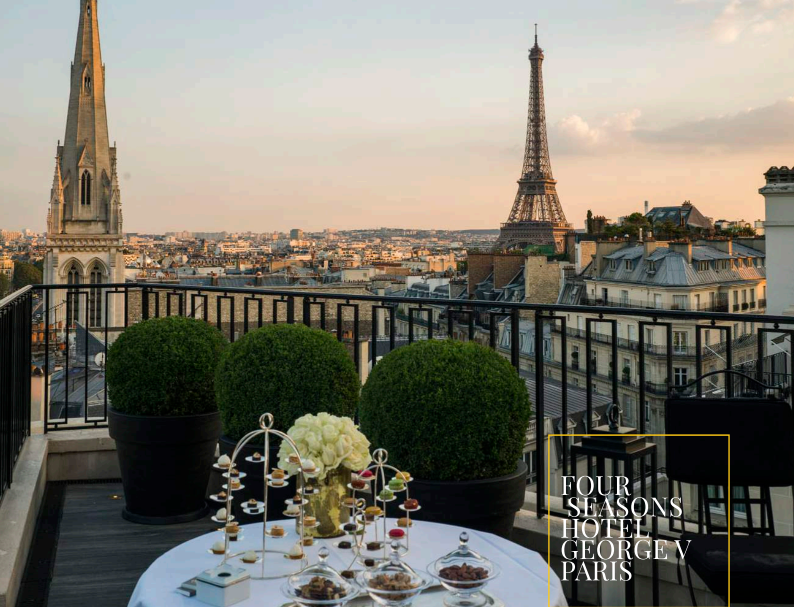
FOUR SEASONS HOTEL GEORGE V PARIS