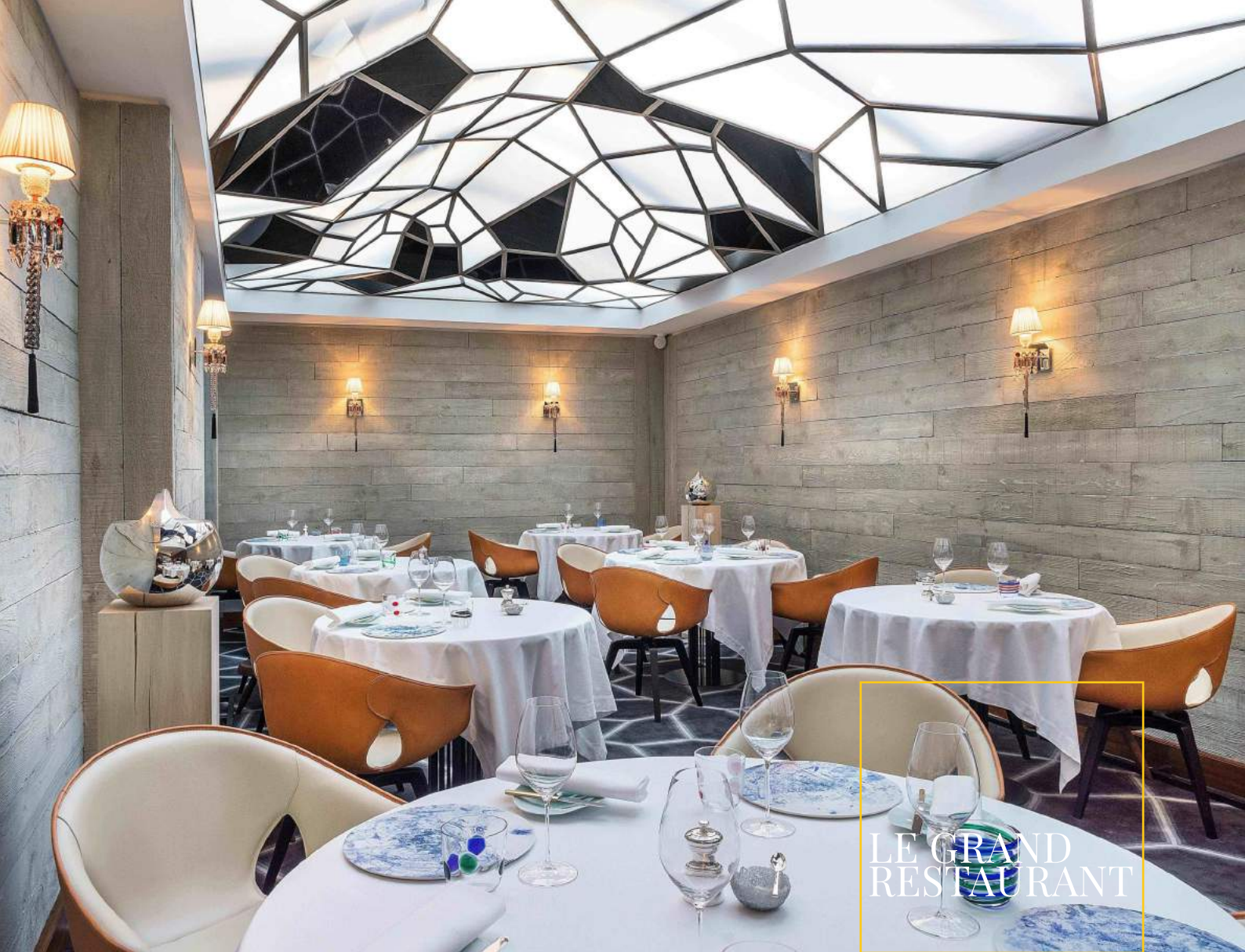
LE GRAND RESTAURANT