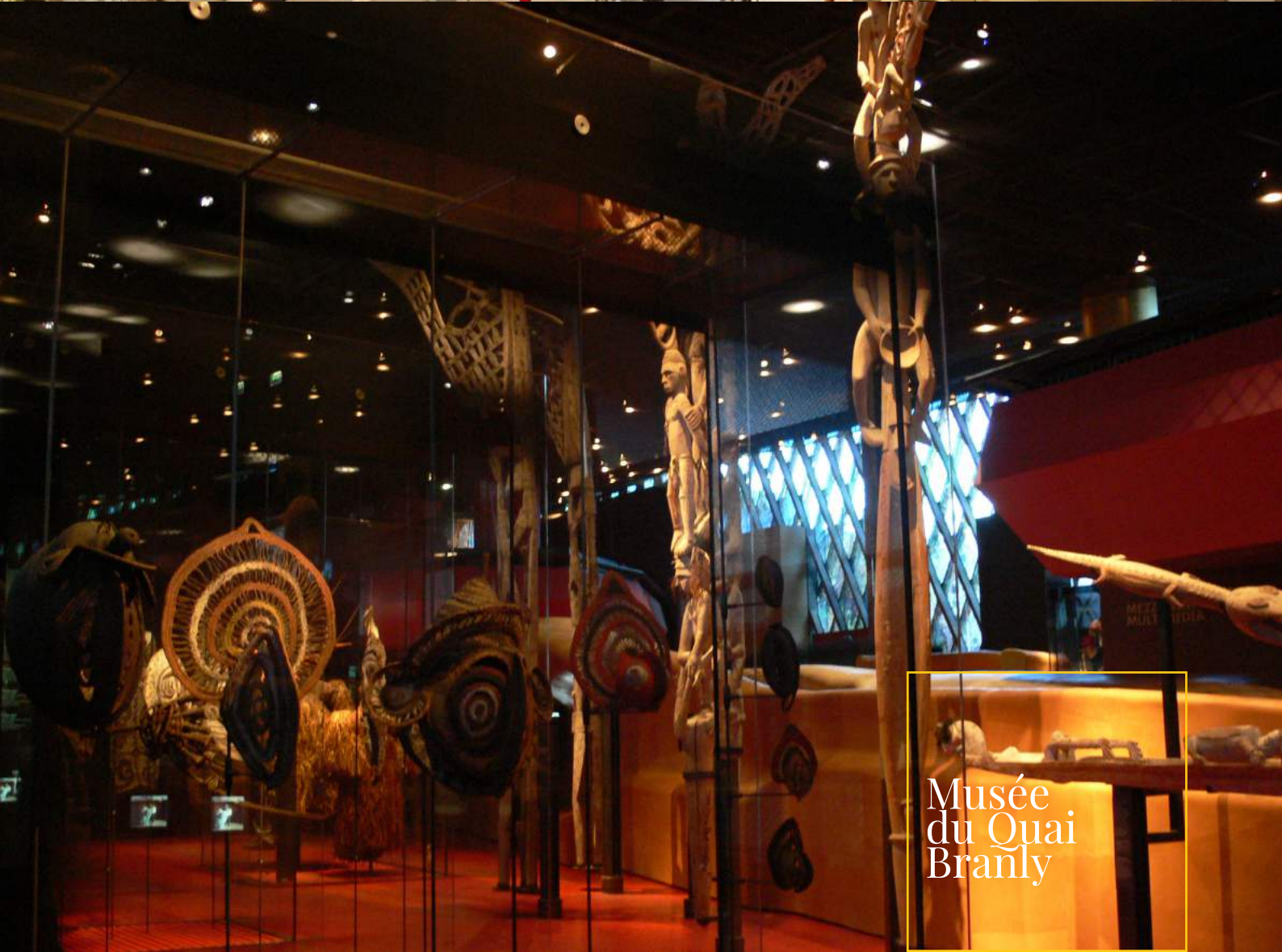
Musée du Quai Branly