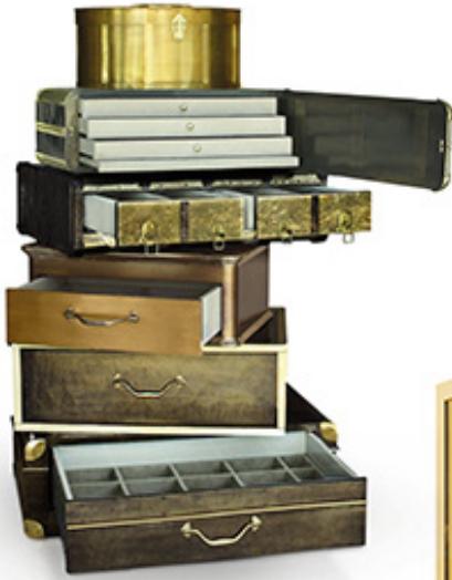
BOHÉME | LUXURY SAFE