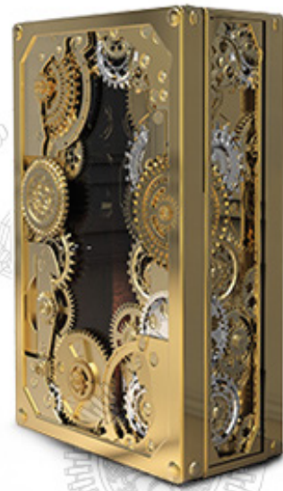
BARON | LUXURY SAFE