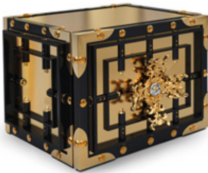
KNOX | WATCH WINDER