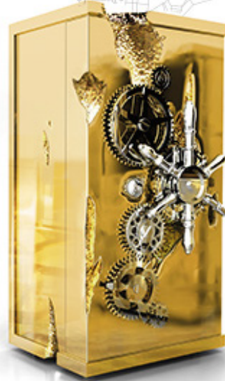
MILLIONAIRE | LUXURY SAFE / WATCH WINDER