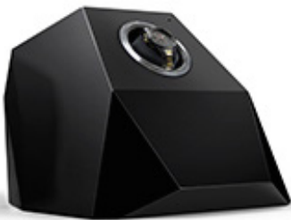
DIAMOND | WATCH WINDER