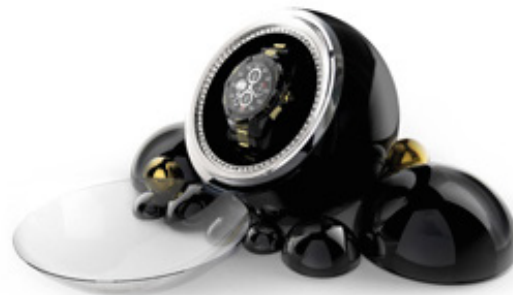
CLOUD | WATCH WINDER