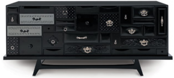
MONDRIAN | SIDEBOARD