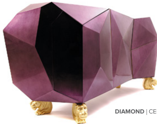
DIAMOND | CENTER TABLE

Mondrian (2007) exudes a sense of both experimental design and luxury, again using different techniques and finishes.