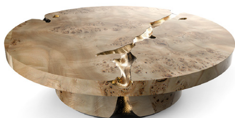
empire center table

Regarding upcoming designs, we are expected to launch another novelty according to the Metamorphosis concept. However, a lot of things have the power to inspire us, and our job is to pay attention to them. As we gain knowledge, the world around us becomes more and more demanding, and it becomes more difficult to surprise and be surprised. That's the challenge! A kind of addiction that takes control over you, creating a sense of discomfort and a permanent craving for surprise at every step you take.