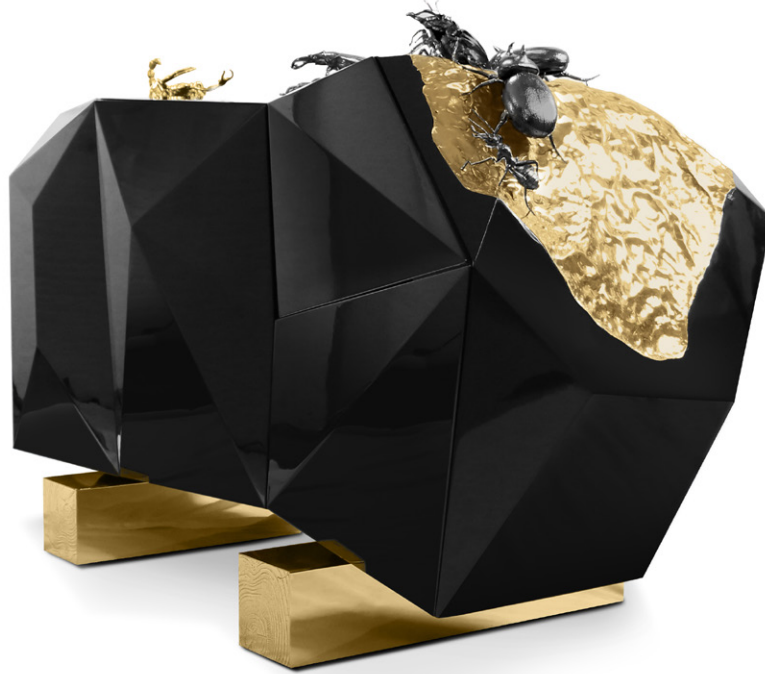
diamond metamorphosis sideboard

This three-piece set includes one of the Boca do Lobo's most iconic design – Diamond Sideboard. Why did you choose this peculiar piece to be redesigned?