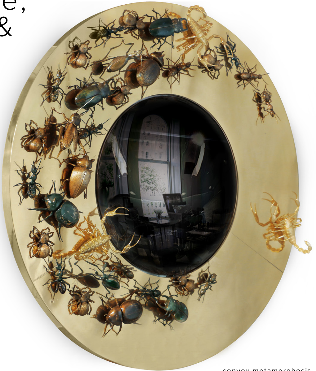
convex metamorphosis mirror