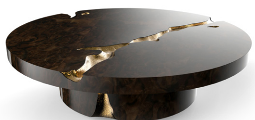
empire walnut center table